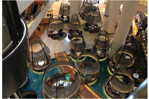
4. Pan Pacific Singapore Hotel