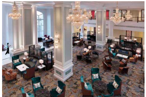
6. InterContinental Singapore Hotel