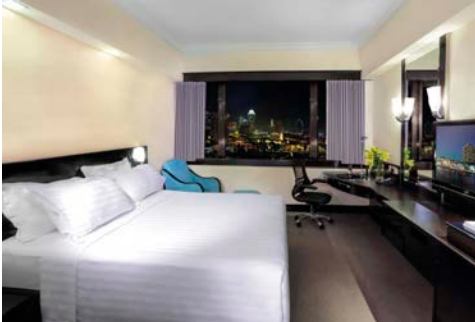
10. Furama City Centre Hotel