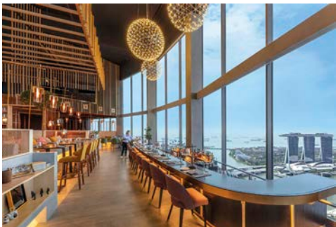
8. The Swissotel The Stamford Hotel