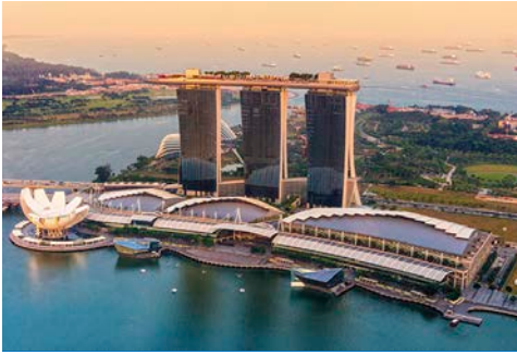
1. Sands Expo and Convention Centre (front right bldg)