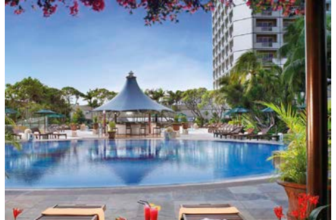
9. Fairmont Singapore Hotel