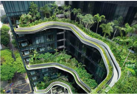
11. PARKROYAL on Pickering Hotel