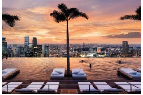
2. Marina Bay Sands Hotel, HQ