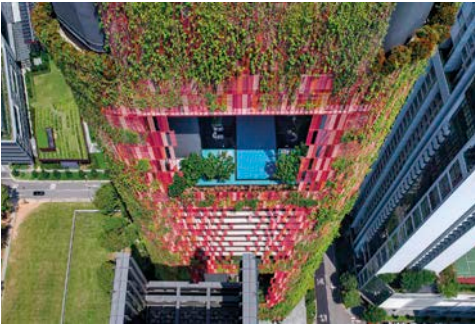
12. Oasia Hotel Downtown Singapore