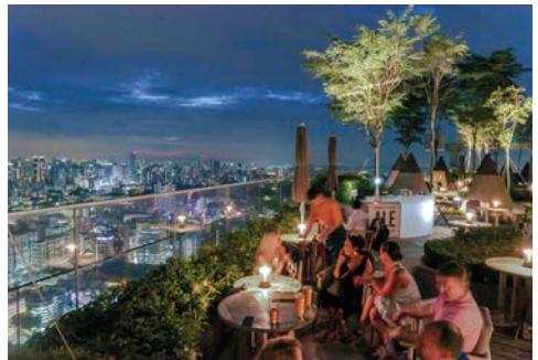
5. Andaz Singapore Hotel