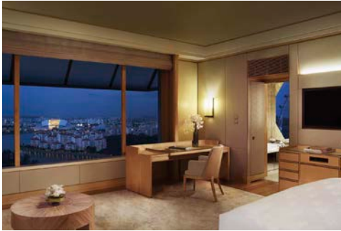
3. Ritz Carlton Millenia Hotel