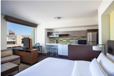
Element Boston Seaport, king studio