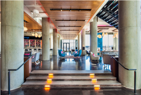
Aloft Boston Seaport District, Remix Lounge