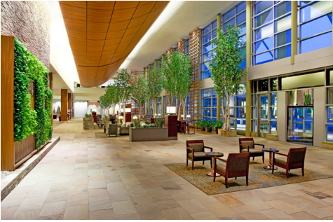
Westin Boston Waterfront (HQ), lobby