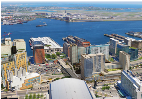
Foreground BCEE & Logan Airport across the harbour