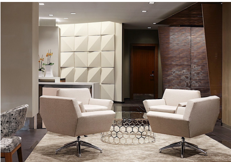
The Godfrey Hotel Boston, lobby