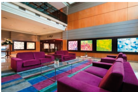
Crowne Plaza Barcelona Fira Center