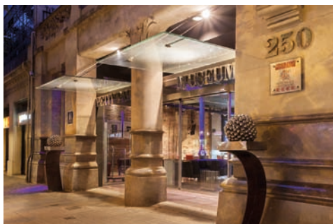
Hotel Petit Palace Museum