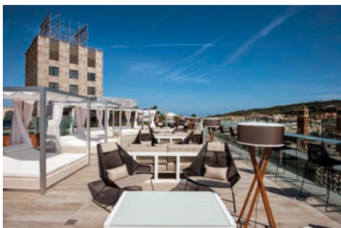
Catalonia Barcelona Plaza