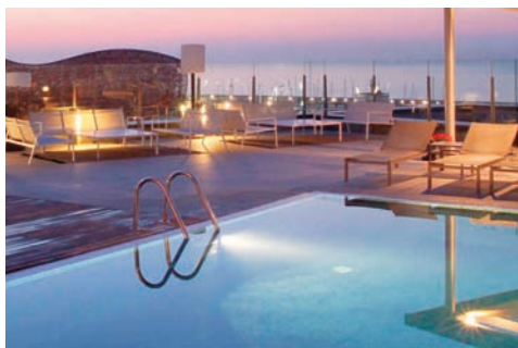
Pullman Barcelona Skipper