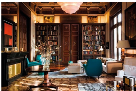
Cotton House Hotel